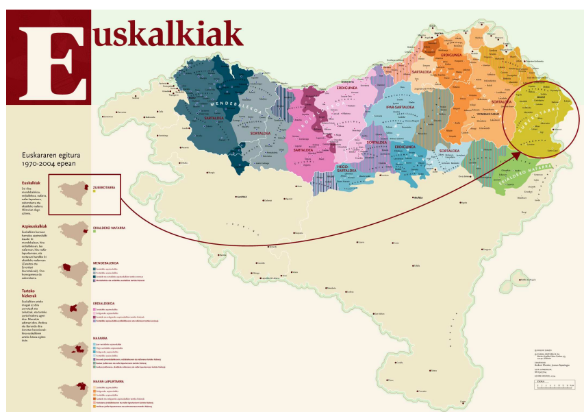
Figure 1: Map of Basque Dialects (Zuazo 2008); highlights added by me.

The paper is organized as follows: in section 2 I present the way in which the definite determiner behaves in Standard Basque, a language where nominals in argument position cannot appear bare, i.e. without the presence of the definite determiner, an indefinite determiner, or a quantifier. Section 3 concentrates on showing the behavior of nominals in Souletin dialect, where nominals can appear bare and be arguments but only in some very specific syntactic positions, in direct object position. I argue that BNs in Souletin project a full DP with an empty D position occupied by a phonetically null D (cf. Contreras 1986, Longobardi 1994, 2001, a.o.), which provides an indefinite interpretation with narrow scope and is unspecified for number. In section 4 it is argued that BNs in Souletin, and in Basque in